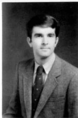
Ralph Shearer Northam